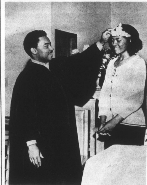
MISS OWENS BEING CROWNED

The Bynum family wishes to thank you for each kind expression shown during the illness of their loved one.