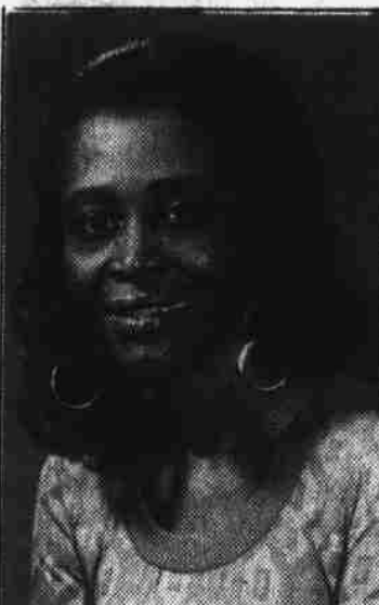
Hold Annual Awards Day Friday, May 3rd

Affairs Task to assist the Democratic Advisory Council