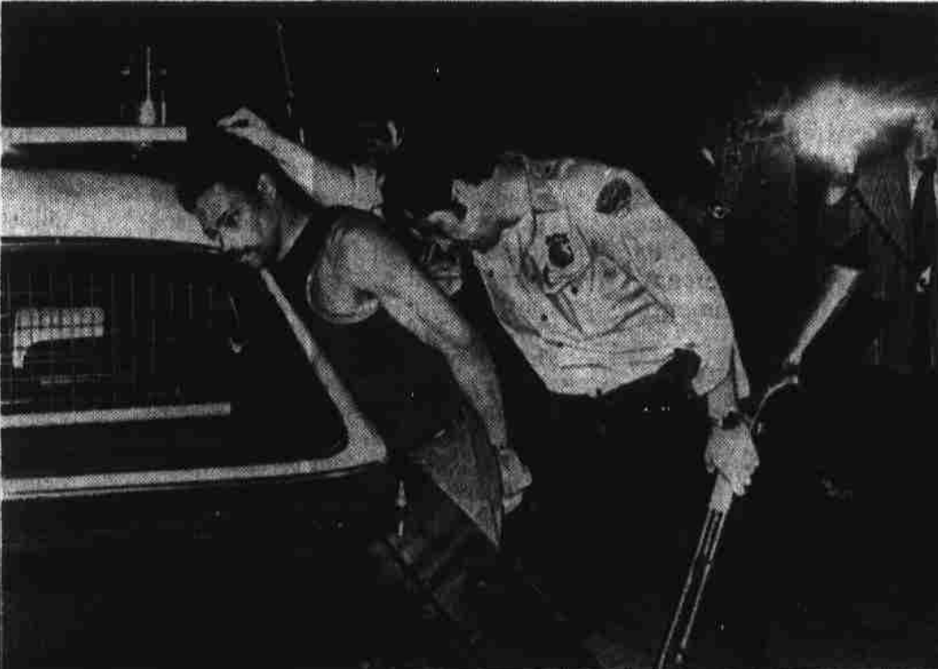
A SUSPECT—CLEVELAND: A suspect is apprehended following a shootout in a kidnap attempt late recently. Four police officers were wounded, one seriously. Authorities said up to 100 policemen from three different departments were involved in the shooting. Three suspects were captured, with two other suspects in the kidnaping remaining at large.

An employee with 29 years of federal and state service in (See NAMED Page 7A)