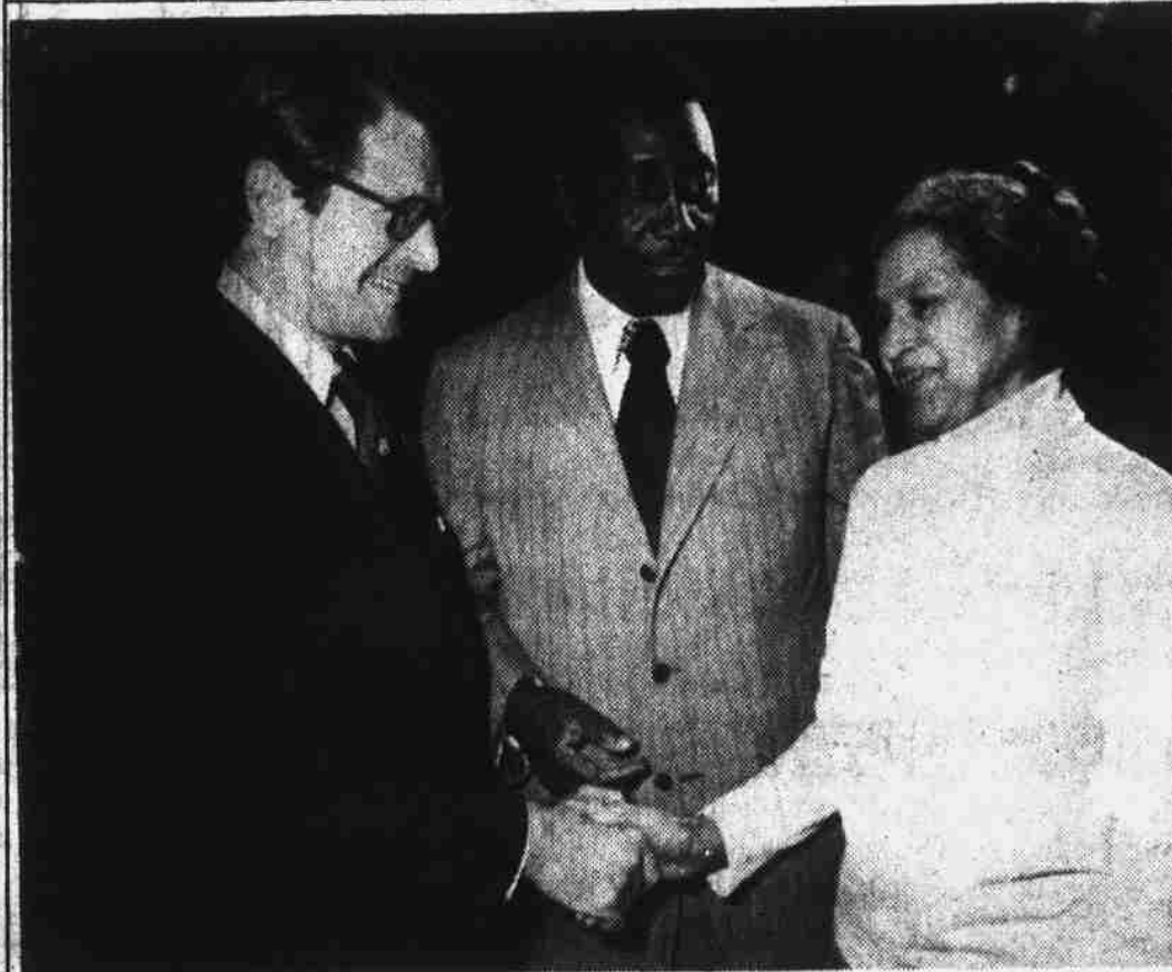
MARK HISTORIC EDUCATION DECISION—NEW YORK: Mrs. Rosa Parks of Montgomery (Ala.) has boycott fame is introduced to former U. S. Atty. Gen. Elliott Richardson (left) by Mayor Charles Evers of Fayette, Miss., as they attend luncheon here May 17, sponsored by the NAACP's Legal Defense and Educational Fund, Inc. Occasion marked 20th anniversary of historic U. S. Supreme Court ruling outlawing segregated education in the U.S.