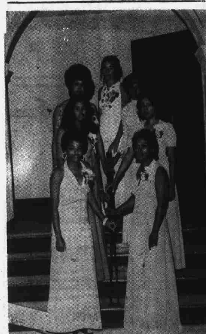
MISS NCCU ALUMNA CONTESTANTS will be modeling fashions at Durham College July 28 at 5:00 P.M. as a part of the Baby Contest Finals. Fashions compliments of Mozella's Boutique.

Nixon is still planning to go to Moscow.