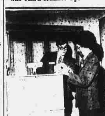
ADAMS DURHAM NATIVE'S HUSBAND ELECTED JAYCEE PRESIDENT