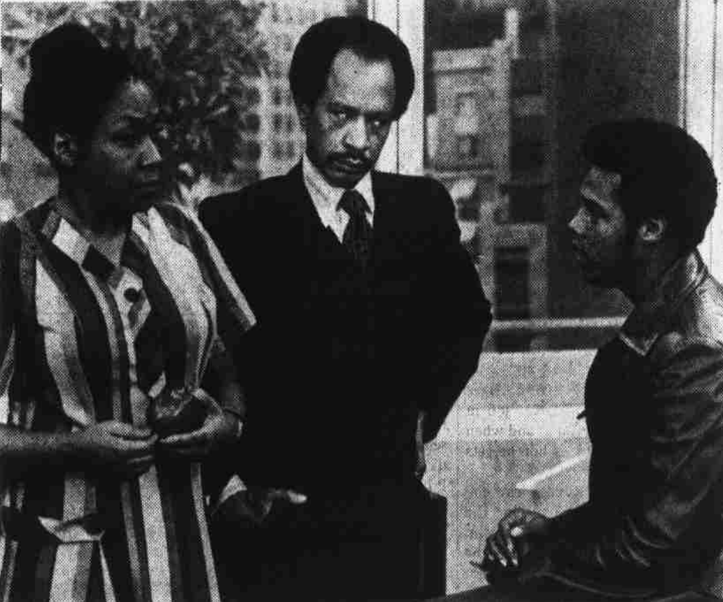
ALI'S NOT QUIET ON THE JEFFERSON FRONT —The Jeffersons soon find out moving up in the world doesn't necessarily mean happiness actually, it's creating quite a bit of tension in the household, as Archie Bunker's former neighbors begin a new and luxurious life as stars of their own comedy series, "THE JEFFERSON," premiering Saturday, Jan. 18 on WTVD Ch. 11. Pictured (l to r): Series stars Isabel Sanford, Sherman Hemsley and Mike Evans as Louise, George, and Lionel Jefferson, respectively.