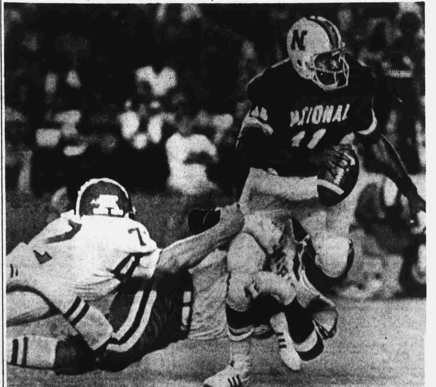
PULLED DOWN—NFC reserve quarterback Jim Harris (11) of the Los Angeles Rams, is about to be hauled down by AFC Jerry Sherk (72) of the Cleveland Browns and Pittsburgh Steeler L.C. Greenwood. Harris was forced to run with the ball in the second quarter making 3 yards on this play. Harris replaced the starting QB Jim Hart in the second period after an injury to Hart. Harris threw two touchdown passes and was voted the MVP.