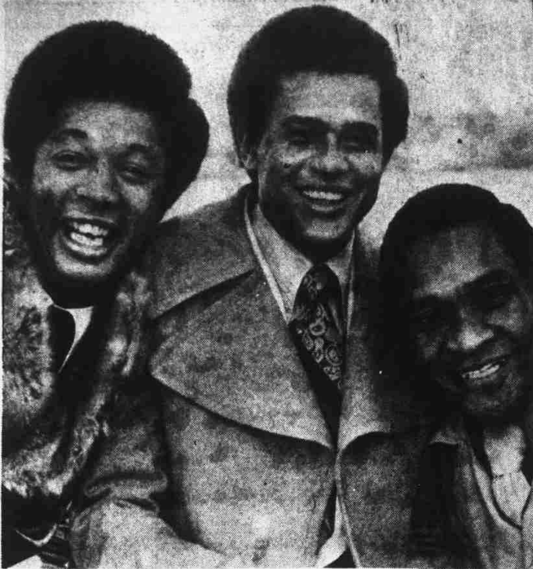
PERFORMING IN AUSTRALIA—Australia which is commonly referred to as the land of down under, is far from being a down under situation for 20th Century Recording artist THE YOUNG HEARTS, who are currently appearing at The Whiskey Club in Sydney, Australia and playing to SRO crowds nightly, while their current single stateside release entitled "Wake Up And Start Dancing," is taking off for Hitsville U.S.A.