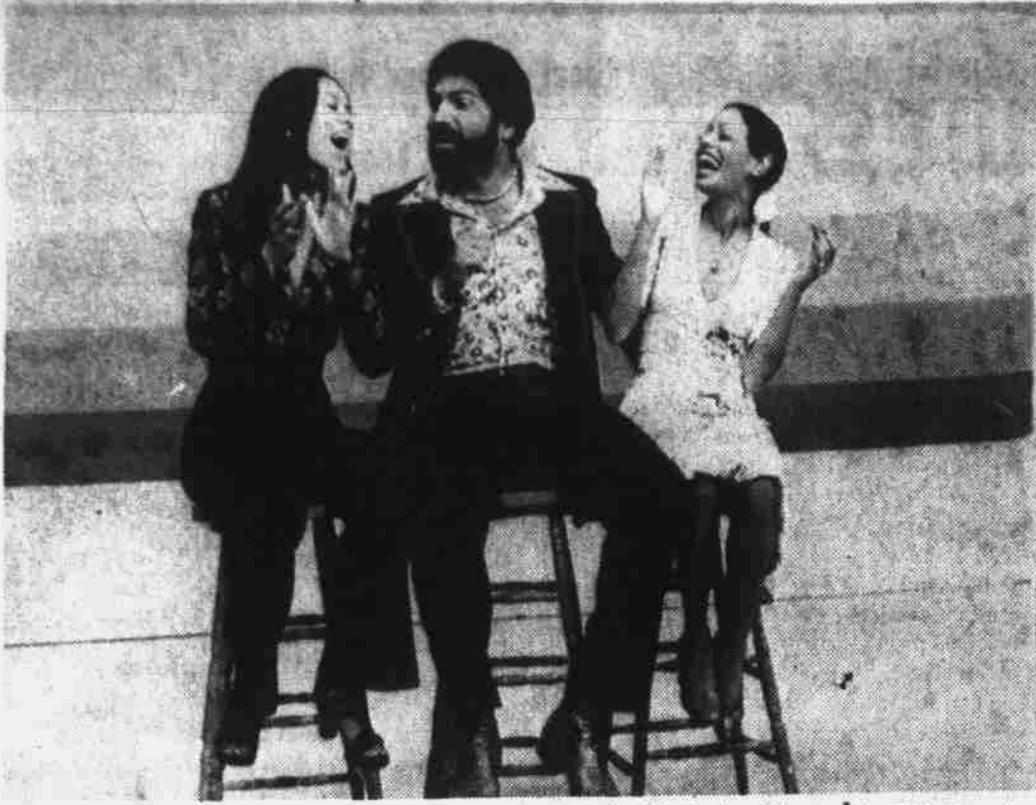
IN SINGING DEBUT —Pittsburgh Steelers' Franco "arris makes his singing debut on the Mike Douglas Show in Philadelphia. With him are two members of the "5th Dimension" singing group, Marilyn McCoo (R) and Florence LaRue. The show will be aired.