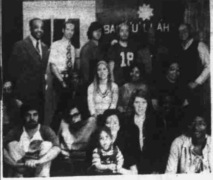
Some of the members of the Baha'i community and their guests who attended the Baha'i New Year celebration, Thursday evening (March 20).