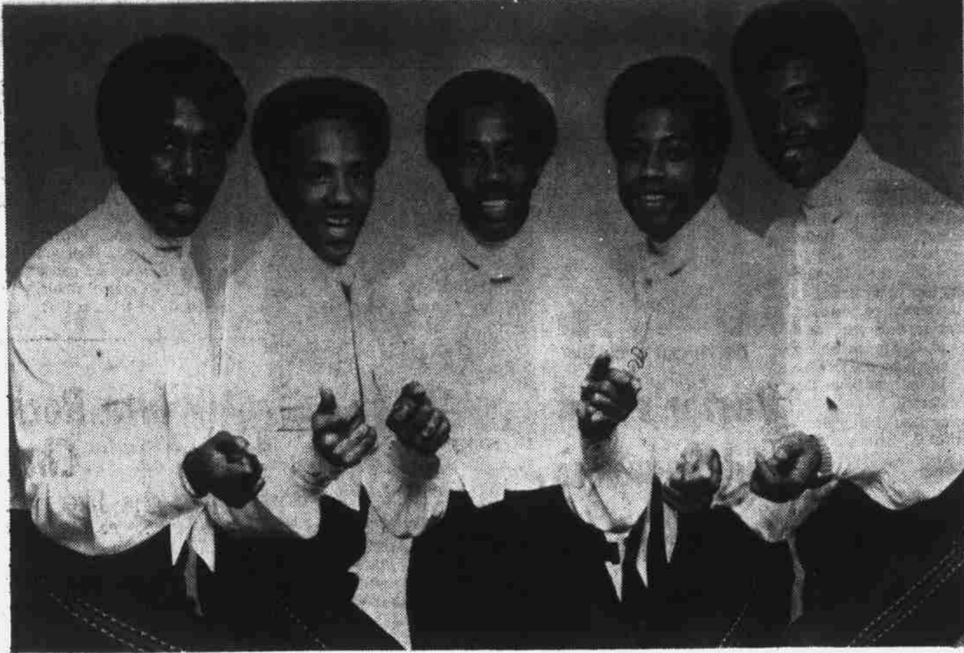
THE TEMPTATIONS TO APPEAR AT THE COLISEUM