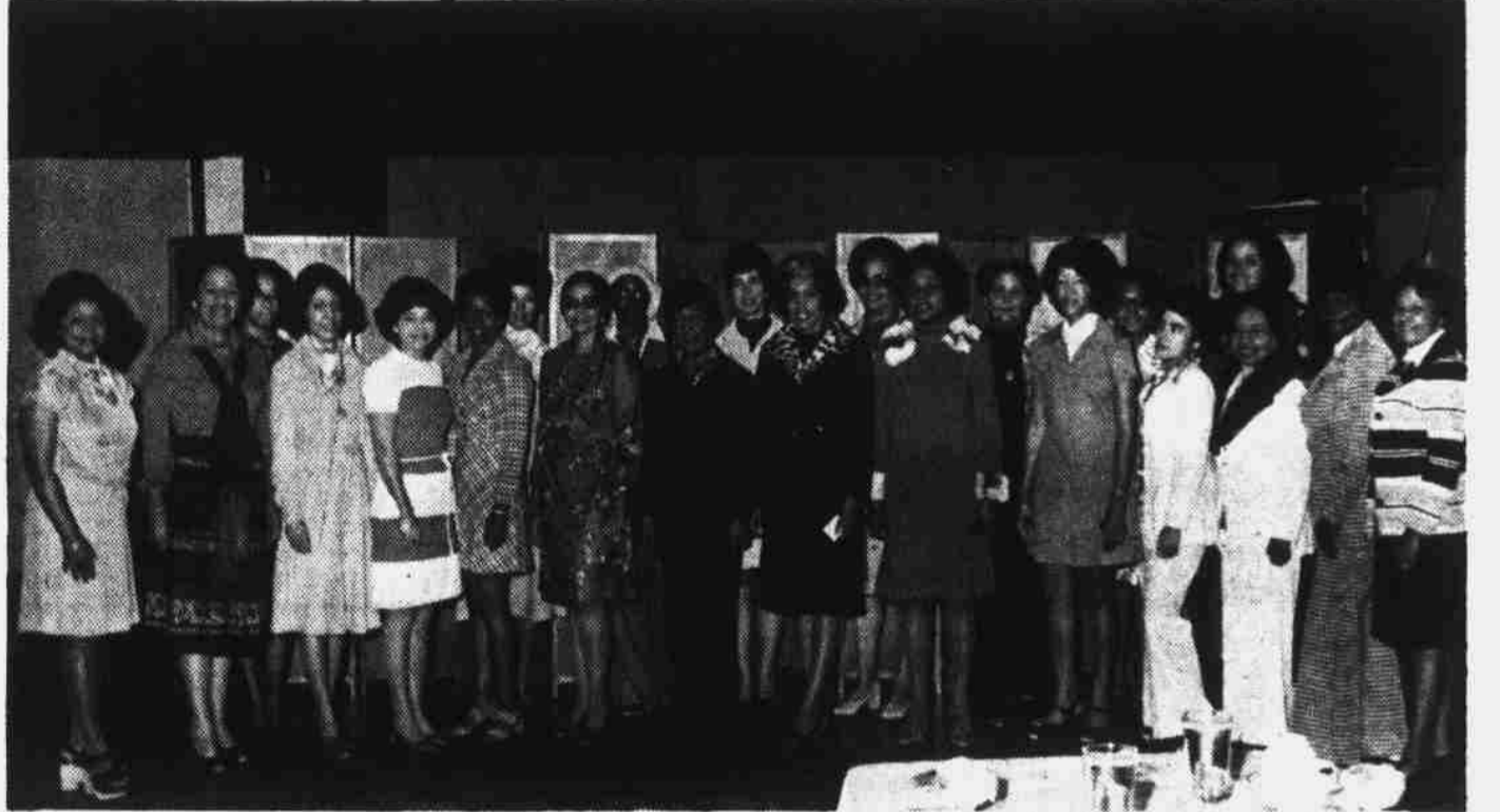
Members of the Durham Chapter of the National Barristers' Wives, Inc. assemble after a lovely luncheon given by them for the members in attendance at the Executive Committee Meeting of the organization.