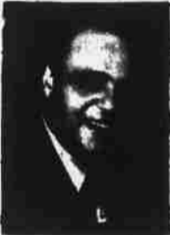
Benjamin L. Hooks FCC COMMISSIONER