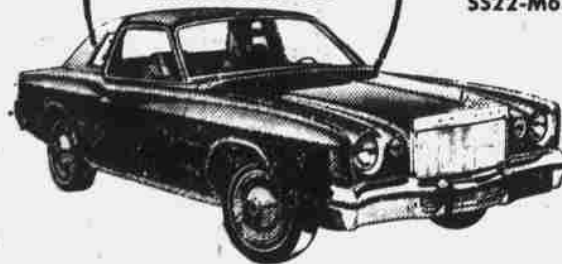
Cordoba 2-Door Hardtop

Serial Nos. 5522-M6R-146816 5522-M6R-148258