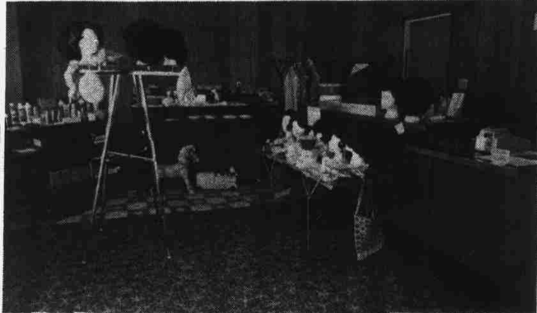
ONLY QUALITY PRODUCTS SOLD AT EGAVAC