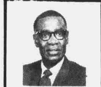
For Your New Or Used Car Needs See