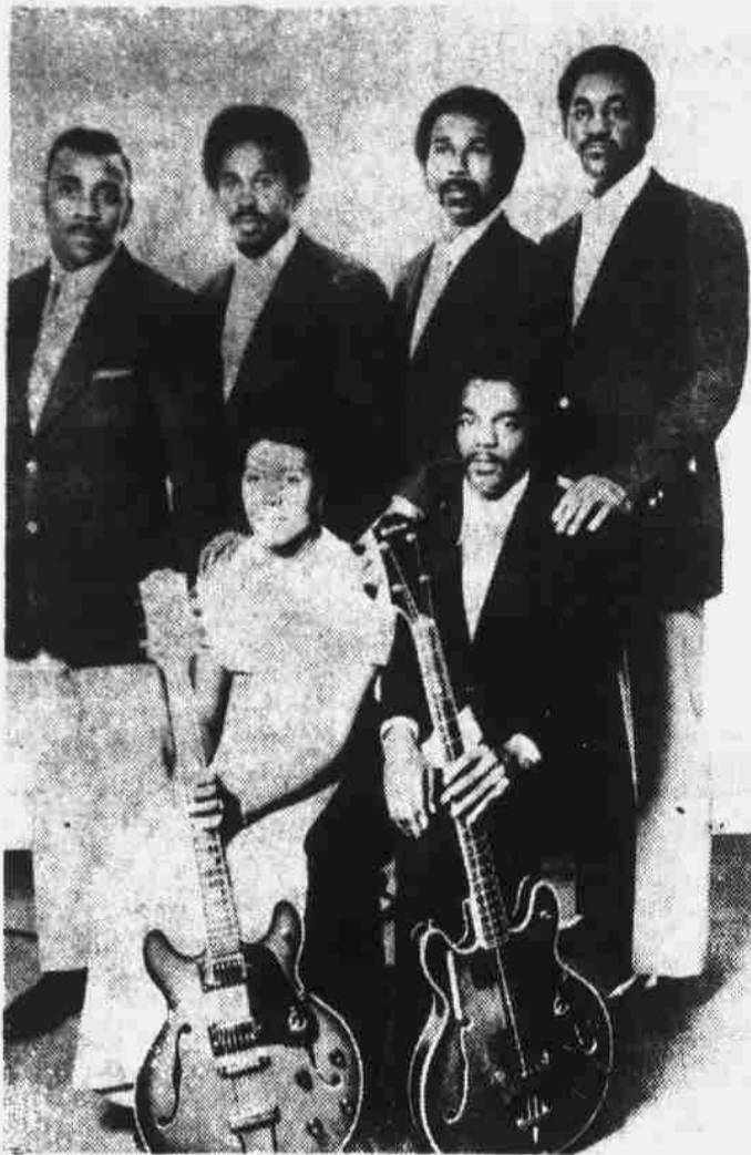
THE KINGS OF HARMONY