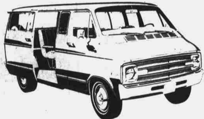
1976 Dodge B-100 Van

Fantastic Saving on these Models & Many More!