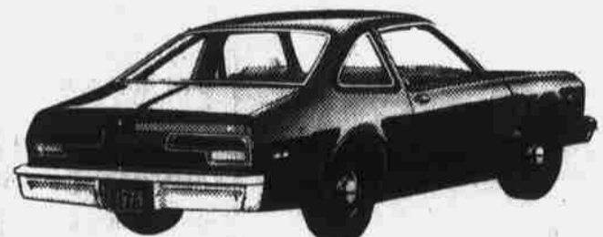
1976 Dodge Aspen

Prices do not include dealer prep, N.C. sales tax, license, freight.