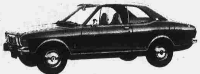
1976 Dodge Colt

Prices do not include dealer prep, N.C. sales tax, license, freight.