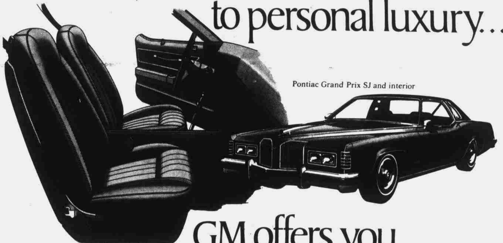
Pontiac Grand Prix SJ and interior

GM offers you more exciting ways to go than anybody.