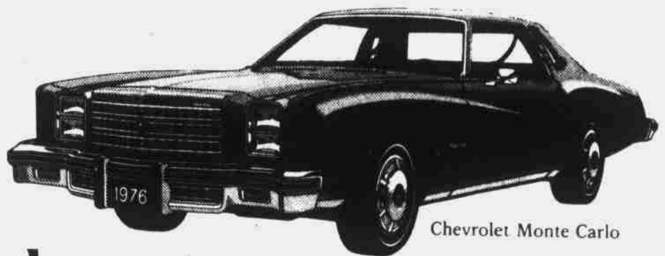
Chevrolet Monte Carlo

South Square Mall Lower Level Durham, N. C.