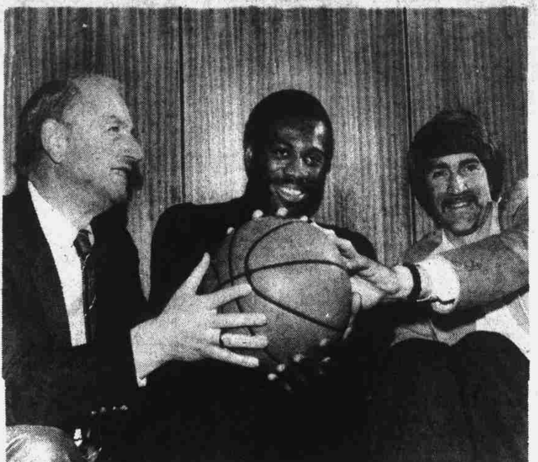
HOLZMAN WELCOME — N. Y. Knicks' coach Red Holzman has the pleasure of welcoming his two new players, Tom McMillen (L) and Bob McAdoo (C). Obtained in trade from the Buffalo Braves after lengthy negotiations, the high-scoring McAdoo, it is hoped, will turn the Knicks' season around.