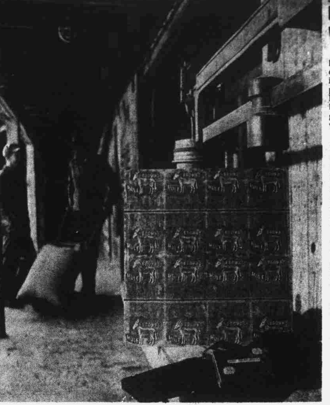
A piece of tin can become a collectors' item if it somehow avoids the scrap pile for half a century. R. J. Reynolds Tobacco Co. found some tin plates used 50 years ago to imprint brand names on plug chewing tobacco. Now collectors are buying the plates as nostalgia items and craft material.

B & G Pipe Shop 303 E. Chapel Hill Street