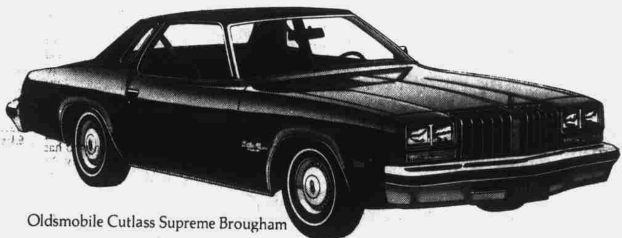
Oldsmobile Cutlass Supreme Brougham