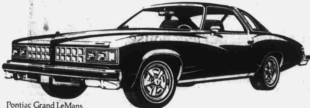
Pontiac Grand LeMans

In 1977, General Motors continues to set the standard by designing and engineering cars that make sense to own and drive.