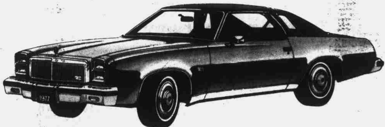
Chevrolet Chevelle Malibu Classic