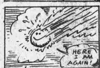
Halley's Comet will next be seen in 1986.

The Cincinnati Bengals, also had control over their season. All they had to do was beat the Oilers down in Houston, and represent the AFC central instead of Pittsburgh. It was not to be. Houston played the spoiler by beating the Bengals 21-16. The Steelers are again in the final eight, and even though they won over San Diego, 10-9, it would not have mattered.