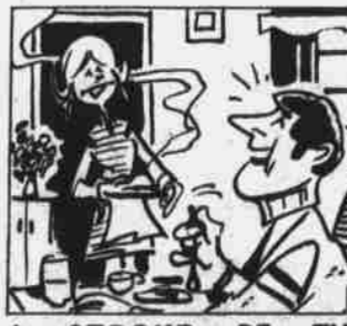
A STROKE OF THE PASTRY BRUSH may make a pie crust a work of art.

If you're making a dessert pie, they recommend that