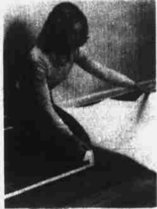
Roll out the floor covering...