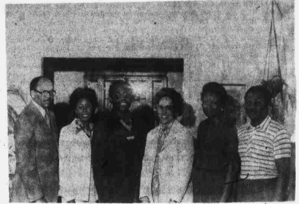
MEMBERS OF OLD FARM GROUP