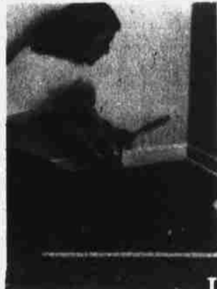
Finish by cutting off excess at wall.

ing. Press flooring firmly to tape and roll out, pulling the paper off tape as you go. Use wall as a straightness guide.