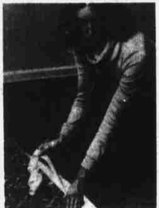
Butt the edges and tape the seams together...