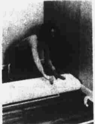
To put down a beautiful flooring, tape the floor...

1. Measure and lay first section. Use edge of wall as guide to roll product out. Allow an additional four to six inches on each end. Cut the section evenly with the scissors. Roll product up so you can remove the release paper from the tape on the floor. Make sure the flooring is in the correct position. Pull release paper from tape near wall to which you rolled up floor-