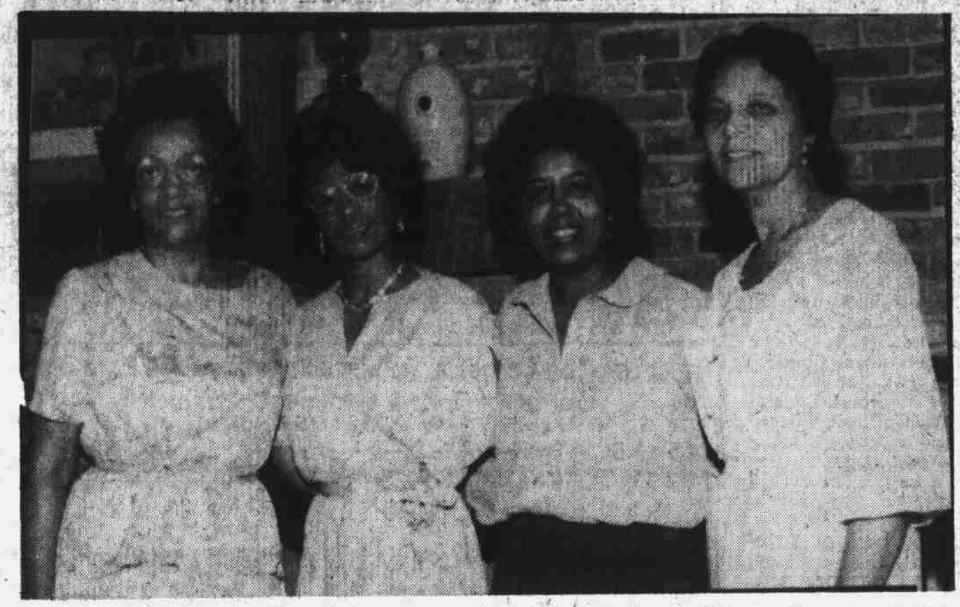
Founder's Day Steering Committee

The Carolina Cimes ADVERTISERS YOU SHOP AT