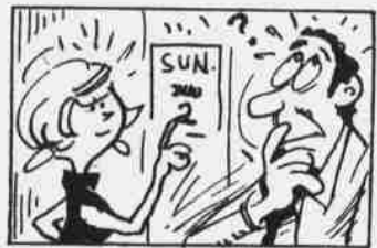
An old law once on the books in Indianapolis, Ind., makes it a crime to argue on Sunday.