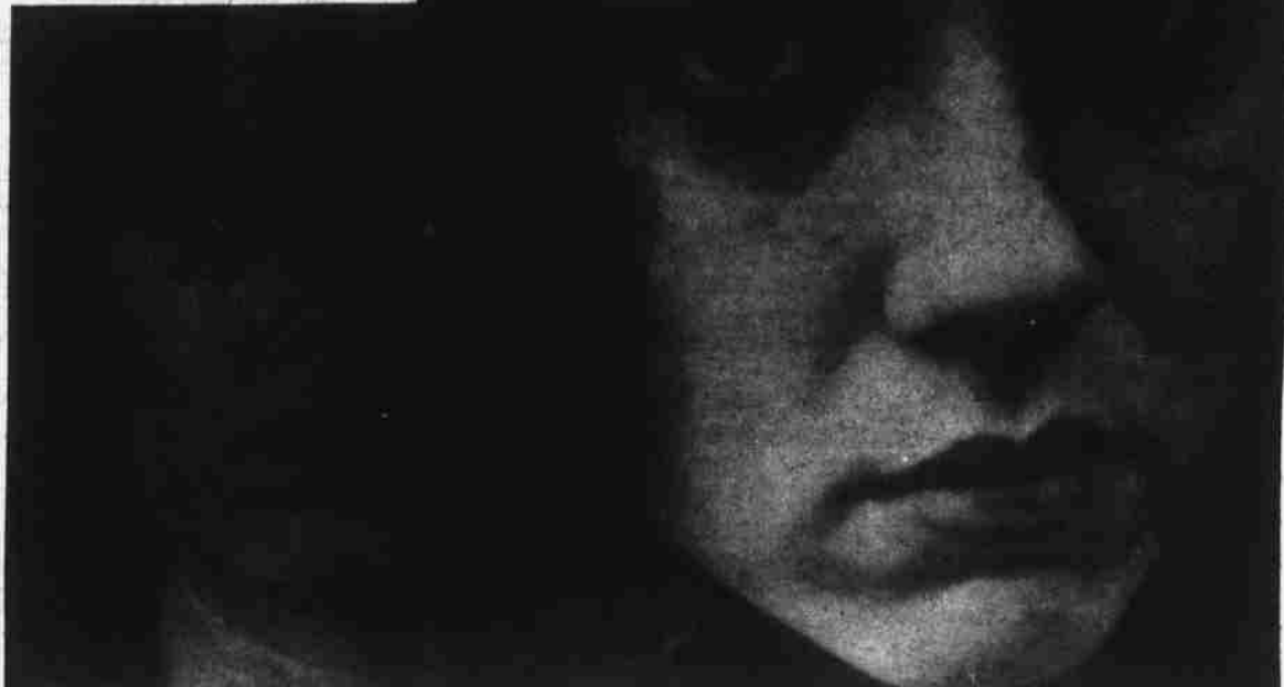
Linda Blair (right) portrays Rachel Bryant, who has a nightmarish encounter with witchcraft after Lee Purcell, as her cousin Julia, moves in with the Bryant family, in STRANGER IN OUR HOUSE , on NBC-TV's 'Wednesday Night at the Movies' June 20.

● PREVIN AND THE PITTSBURGH 'A Feast of Walton' Maestro Andre Previn honors composer Sir William Walton with a performance of his oratorio 'Belshazzar's Feast,' which includes baritone John Shirley-Quirk, the Penn State University Chorus and the