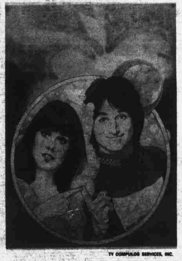
MORK & MINDY

On Thursday, June 21 ABC-TV will present an encore episode of the smash hit series 'Mork & Mindy'.