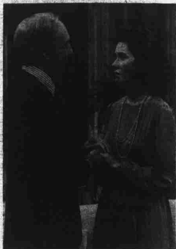
TV COMPULOG SERVICES, INC.