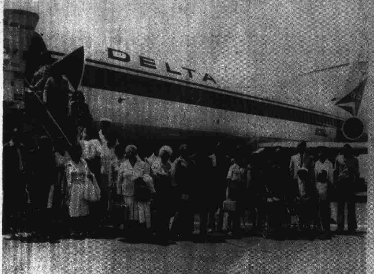
Members of Williams Family Circle As They Prepare To Leave Raleigh Durham Airport For Holiday In Chicago.