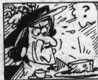
In Victorian days it was considered unladylike to eat cheese.