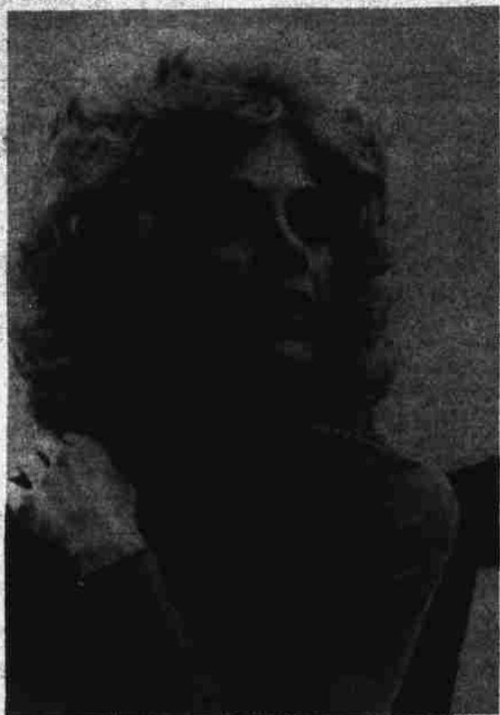
TV COMPULOG SERVICES, INC.