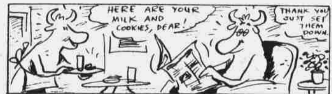
The first cattle were domesticated around 6000 B.C. in Greece.