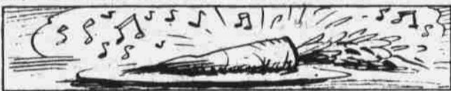
Richard Wagner, the famous German composer, was a vegetarian.

The stayed City National Bank of Beverly Hills California turned into a first rate disco dance hall as the Jacksons celebrated their album "Destiny" becoming platinum as sales of the discs topped the 1,000,000 mark. Actress Tatum O'Neill was among the celebs that joined Michael Jackson and his brother on the disco floor as they kicked up their heels on June 20.