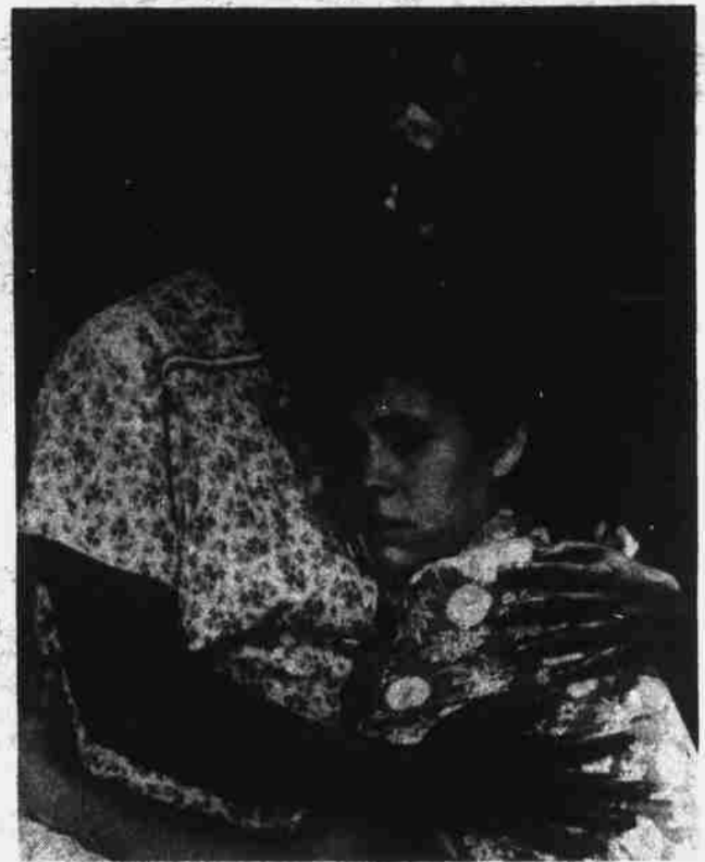
Esther Rolle (left) portrays a housekeeper who becomes a close, understanding companion to a Georgia teenager (Kristy McNichol) after she is shunned by her family and neighbors for befriending a POW, in SUMMER OF MY GERMAN SOLDIER , rebroadcast on NBC-TV's 'The Big Event,' Sunday, July 15.