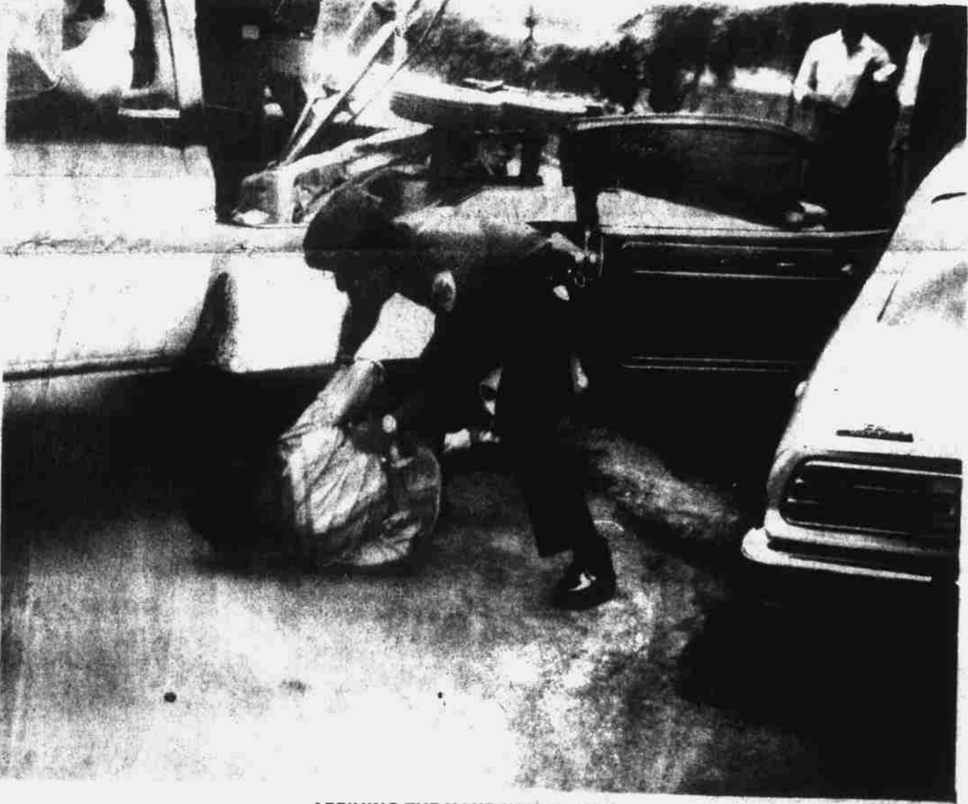
AFFIXING THE HANDCUFFS - TWO