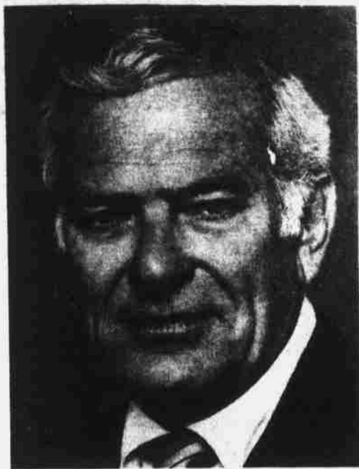
TV COMPULOG SERVICES, INC.