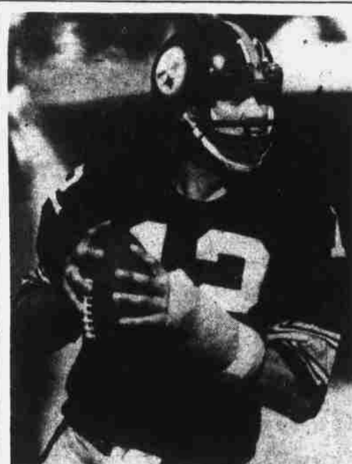
TV COMPULOG SERVICES, INC.