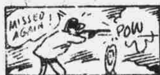
A "tyro" is a beginning rifle shooter.