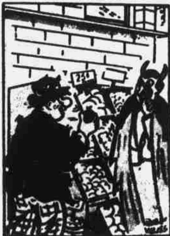
The devil owes most of his success to the fact that he is always around. 16