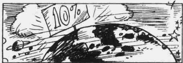
Africa is the second largest continent but has only ten percent of the world's population.