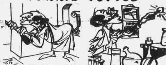
Fire prevention regulations originated in the Roman Empire about 18 B.C. when height and wall thickness restrictions were established.