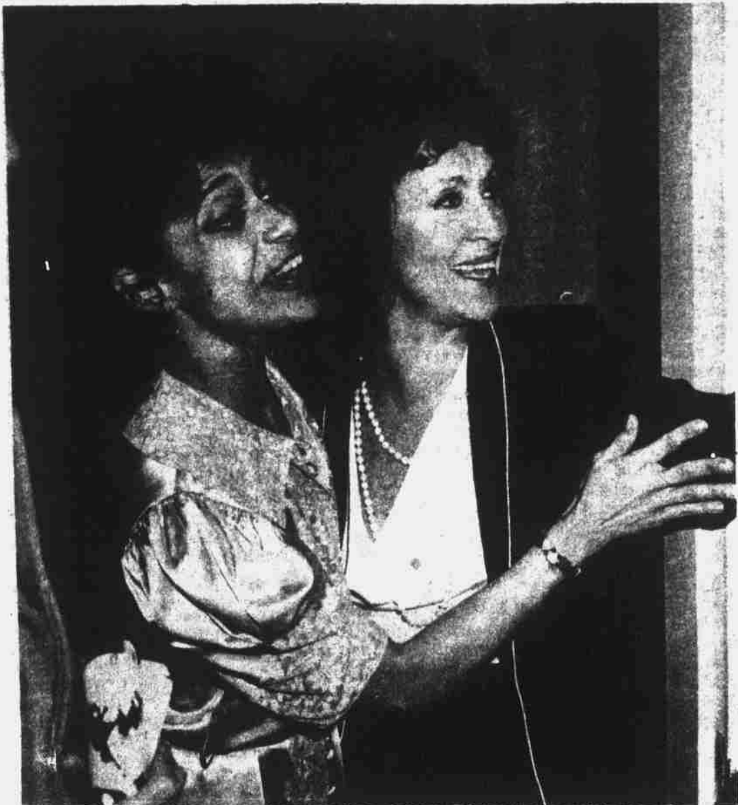
NEW YORK —Chita Rivera (right) is on hand to congratulate Debbie Allen backstage after the February 14 opening of the Broadway revival of the musical West Side Story . Some 23 years ago, Chita danced and sang her way to stardom as Anita. In his review of the revival, Walter Kerr of The New York Times had special praise for Debbie, noting that she is "worth checking out on the double."

(ABC) INTERNATIONAL BOXING: 3:15 PM E.S.T. - 2:15 PM C.S.T.