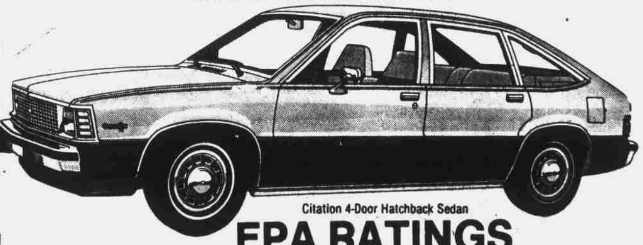
Citation 4-Door Hatchback Sedan

Carpenter's Has... America's No. 1 Selling Front Wheel Drive Car (And that includes Imports) 1980 CITATION Built in America with American Parts and Service.