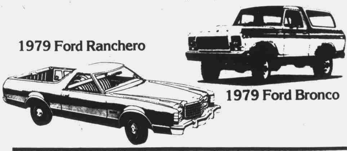
1979 Ford Ranchero