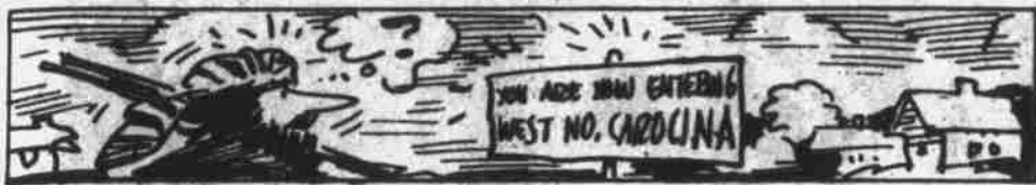
Prior to 1790, Tennessee was just the western section of North Carolina, then ceded to the federal government.