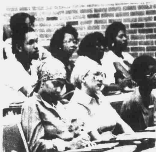
Students Look On

Thirty-five minority health science students who are committed to pursuing a graduate or professional health program in the biomedical sciences, medicine, dentistry, veterinary medicine, optometry, podiatry, public health, and nurse midwifery are participating in an eight-week residential academic enrichment program, the 1980 Summer Academic Advancement Program (SAAP), at the University of North Carolina at Chapel Hill. The summer program is the fourth component of the year-round four-part enrichment/retention Health Careers Academic Advancement Program, sponsored by the N.C. Health Manpower Development Program and funded with a grant from the Health Careers Opportunity Program (HCOP), Office of Health Resources Opportunity (OHRO), Health