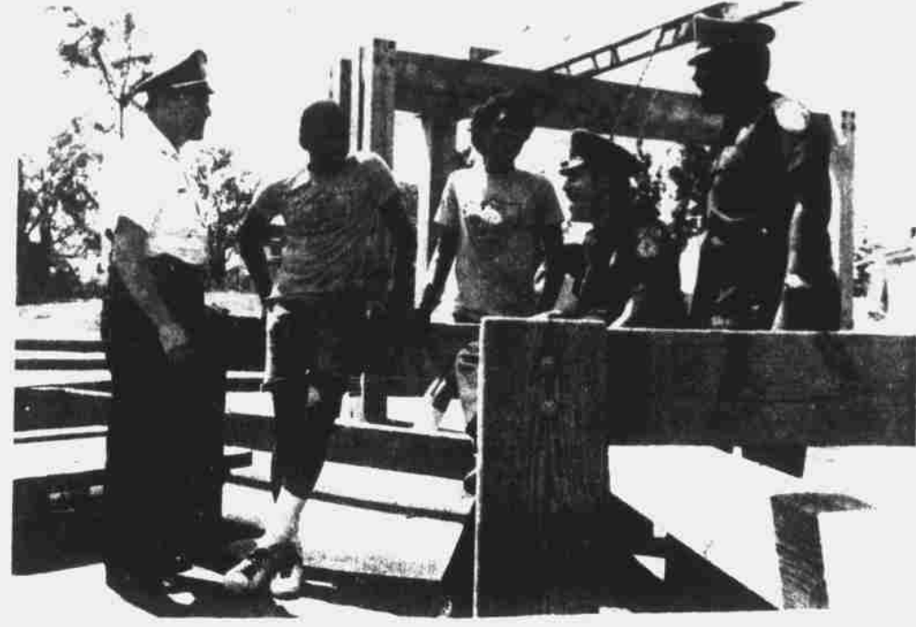
Teens On Patrol