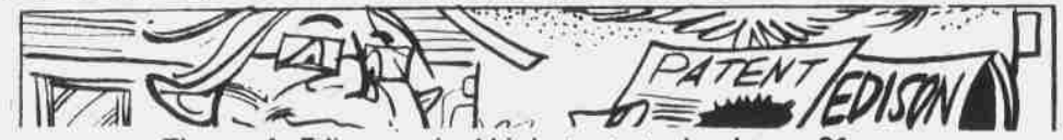
Thomas A. Edison received his last patent when he was 81.

director of the Academic Skills Center, which permits NCCU to admit students with remediable difficulties in basic academic skills.