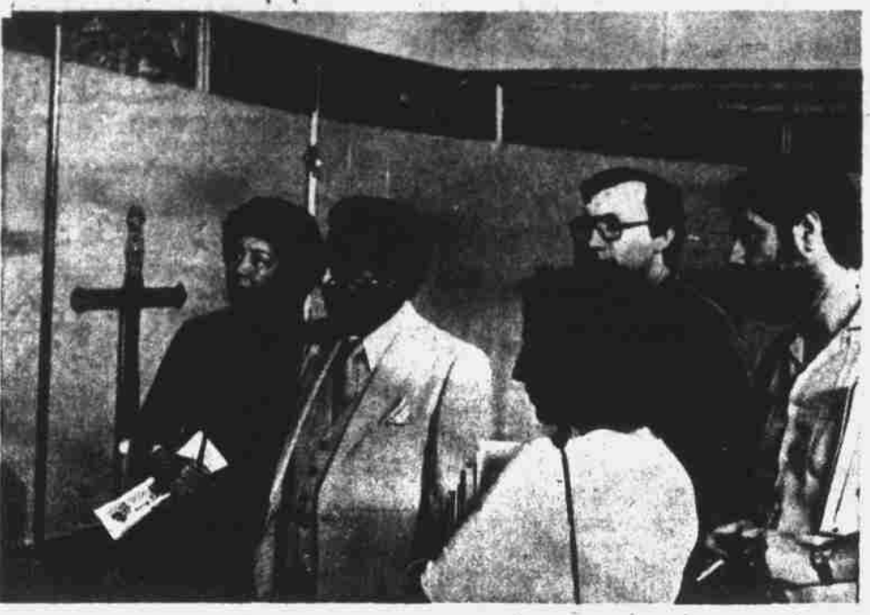
Lowerys In Italy