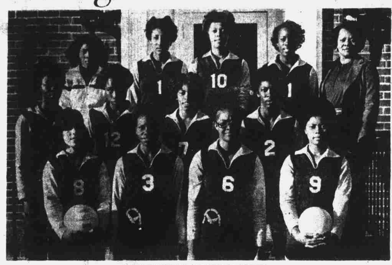
1980 NCCU VOLLEYBALL TEAM

The 1980 NCCU Volleyball Team will compete in the 2nd Annual CIAA Volleyball Tournament to be held at NCCU's McDougald and Women's Gymnasiums Friday, October 31 and Saturday, November 1.