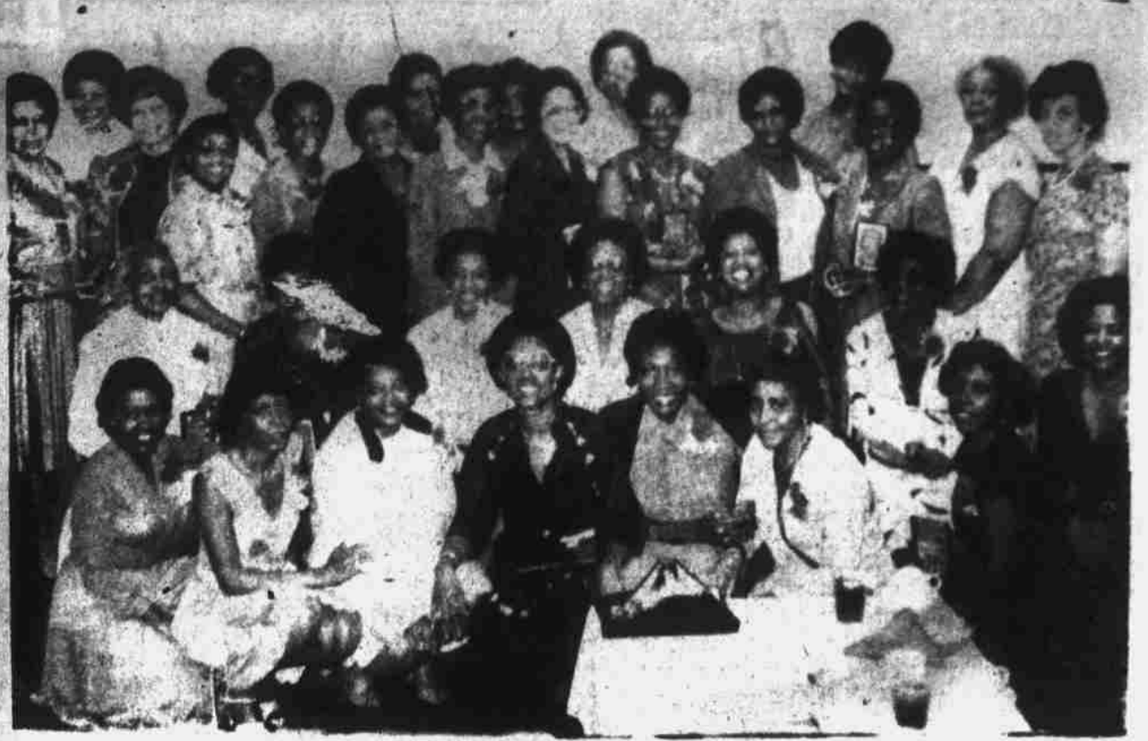
MEMBERSHIP Today's Woman