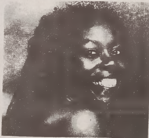
JAWOLE WILLA JO ZOLLAR