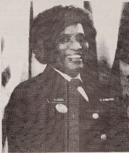
U.S. Surgeon General Jocelyn Elders talks about her controversial first months as the nation's top medical adviser, including her liberal beliefs, and tells the touching story of how, as a teenager, her siblings struggled to help her go to college, in the special February EBONY feature, "In The Eye Of The Storm."

Group tours of the exhibition may be arranged by calling 919 560-6211.