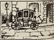
The first hospital to use ambulances was Bellevue in New York City in 1869.