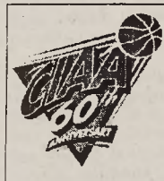
CIAA 60th Anniversary logo

HISTORIC TEAM: Go online to help select 60th CIAA Tournament Team.