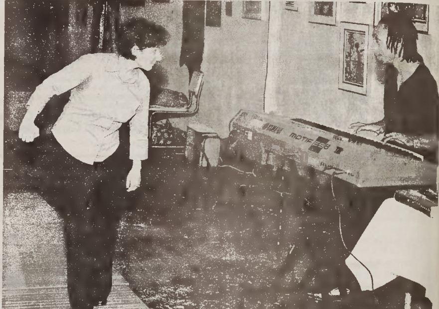
Dancer getting in the mood.