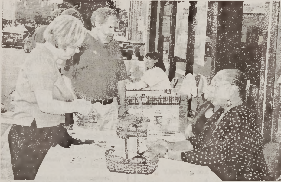
Grandparents Network sharing its' mission at the Artful Concepts event for Bimbe and the Artwalk