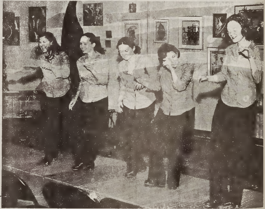
Good Foot celebration of the contribution of the Hometown Heroines