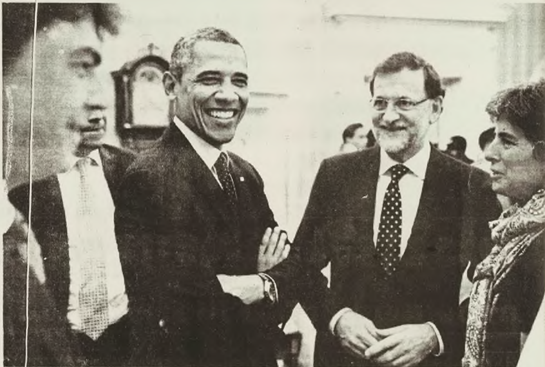
President Barack Obama talks with Prime Minister Mariano Rajoy of Spain following their bilateral meeting in the Oval Office, Jan. 13.

Black Press Black Press believes that America can best lead the way from racial and national antagonisms when every person, regardless of race, color or religion, and legal rights. Hating no person, fearing no man, the Black Press strives to help every person firm belief that all are hurt as long as anyone is