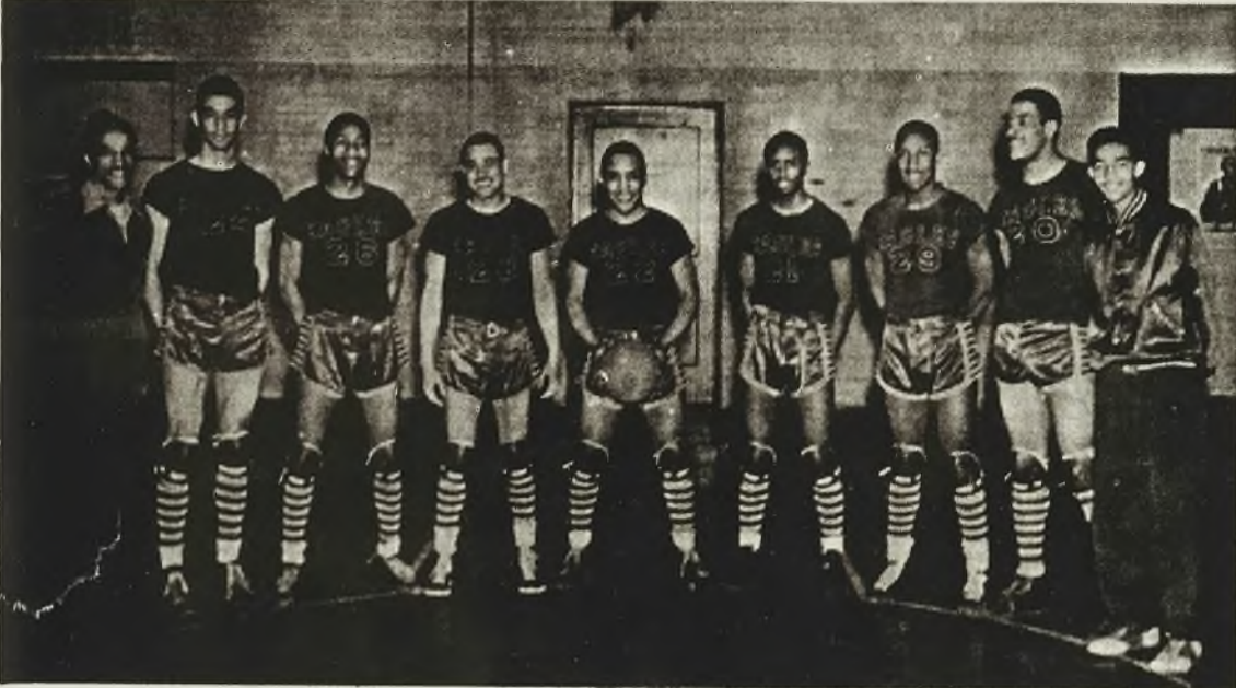
A MOMENT IN HISTORY: 70th ANNIVERSARY OF 'THE SECRET GAME' NCCU, Duke Played Illegal, Racially-Integrated Basketball Game on March 12, 1944. Seventy years ago, March 12, 1944, NCCU and Duke played an illegal, racially-integrated basketball game that later became known as "The Secret Game."

The Raleigh Durham Airport Authority has posted a bidding opportunity on www.rdu.com that involves the rehabilitation of pavement at various locations on the airport as well as various drainage improvements. The work will be awarded to one General Contractor. Please see http://www.rdu.com/business/busopp-list.html for details regarding the scope of the work and the bidding process.