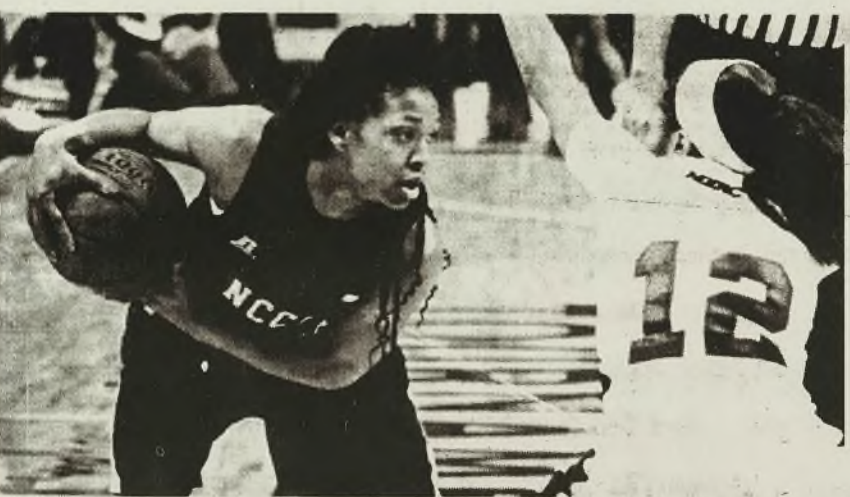
LADY EAGLES GO DOWN IN DEFEAT