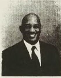
North East Baptist